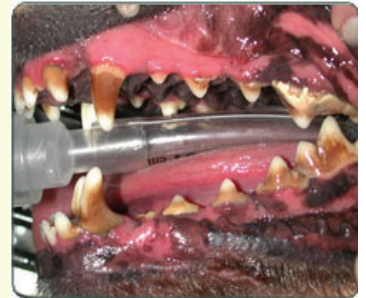
Dog's Teeth Before Dental Cleaning

Our doctors are offering 10% discount on dental scale and polish for any pet that is diagnosed with dental disease during a vaccination consult. Ask for your discount voucher.