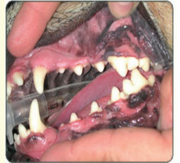
Dog's Teeth After Dental Cleaning