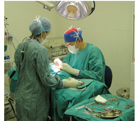
Valley Farm's operating theatre

Both spaying (females) and castration (males) are routine procedures with your pet just staying the day with us. Home care is minimal and most pets are back to normal within a few days. When we spay a dog or cat we remove the ovaries and the uterus. Castration is the removal of the testicles. Although these are routine we treat these procedures as seriously as we would any other. Pre operatively all patients get a catheter placed in their vein and a pain relief injection. All anaesthetics are monitored by qualified nurses and the operation is performed in the operating theatre by experienced surgeons.