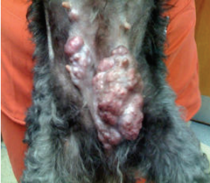
Extensive mammary tumours

There are many benefits to you and your pets when sterilised. In fact there is no reason not to sterilise a pet. The benefits in both males and females, cats and dogs; it makes them more focused on you as they are not looking out for a mate also it reduces hormone related aggression.