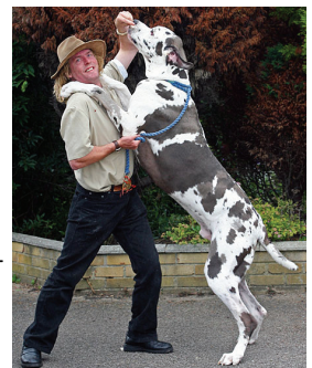
Harlequin Great Dane

Like most giant breeds Great Danes have a predisposition to Gastric dilatation volvulus, a life threatening condition where a stomach heavy with food or water twists on it's self. They also often suffer from heart disease. They have a relatively short live expectancy with 7 years being about the average that they live to.